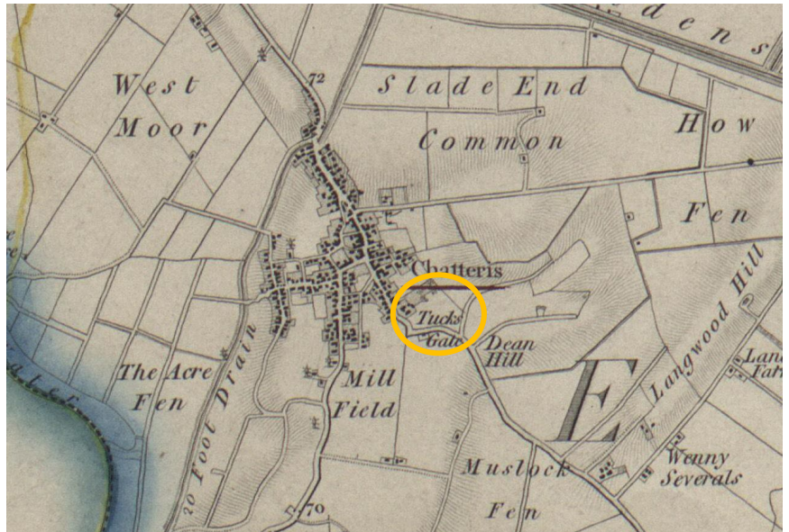
Figure 1 Ordnance Survey 1803

The arrangement of the land remains in a similar condition until the mid-20 th century when 19 Wenny Road was constructed to the north west of the Manor House. By the 1980s, the Parkside housing development was constructed to the north of the Manor House (ref: F/1051/86/O), as was the Manor Gardens development to the south (ref: F/1032/86/O) within the former garden area to the south of the Manor. The development to the north, in Parkside, has effectively sub-divided the Manor House