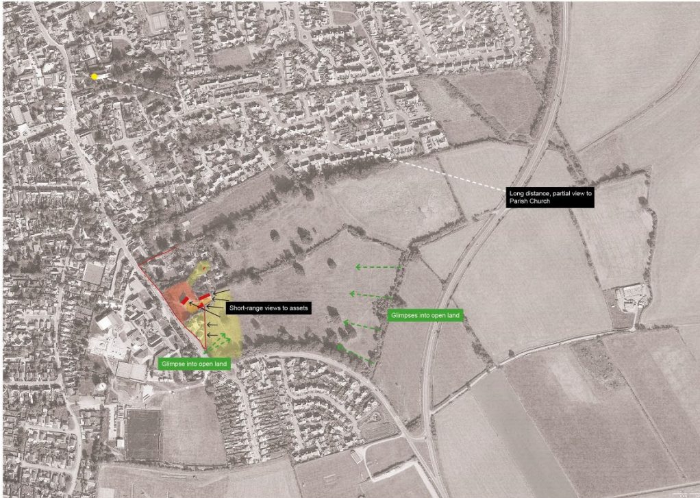
Figure 4- Illustrative map of settings and views

The settings of the Manor House heritage assets have been colour coded below to show their relative value. Red – Good, Orange – Medium, Yellow – Medium/Low