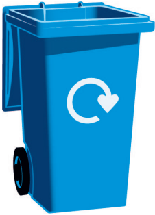
Blue bin recycling

These items are recyclable and can go in the blue bin