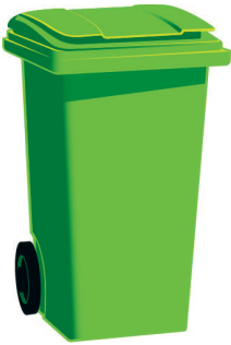
Green Bin Household Waste

These items cannot be recycled in the blue bin and will need to go in the green bin