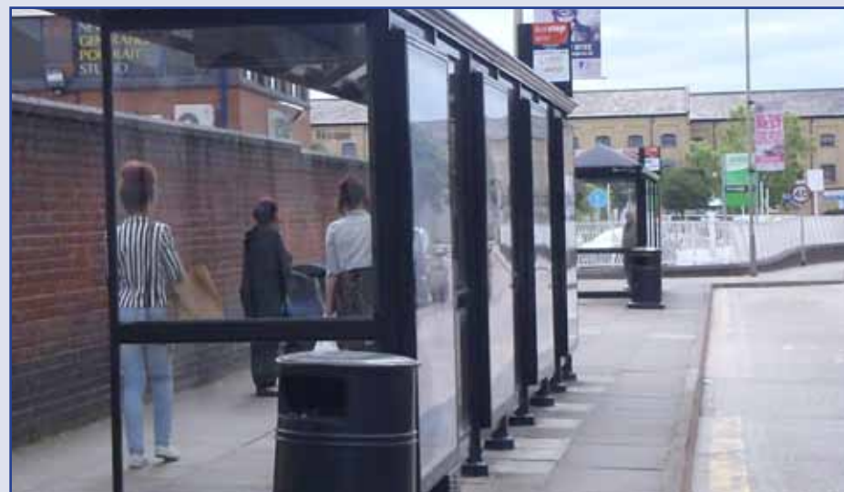
Case study 9 – Whittlesey to Peterborough City Hospital using Rivergate Bus Stop