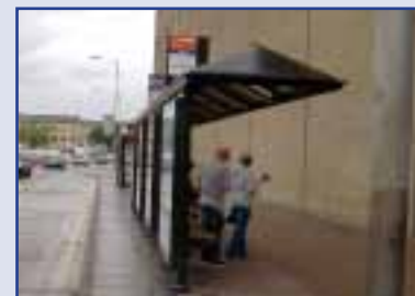
Rivergate bus stop for travel back to Whittlesey

This will drop Mrs J off at the Rivergate Shopping Centre where she is able to catch a bus back to Whittlesey.