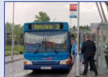
Bus stop outside Peterborough City Hospital

Once Mrs J has finished her hospital appointment she is able to catch either the Citi 3 or Citi 4 bus service from outside the hospital entrance