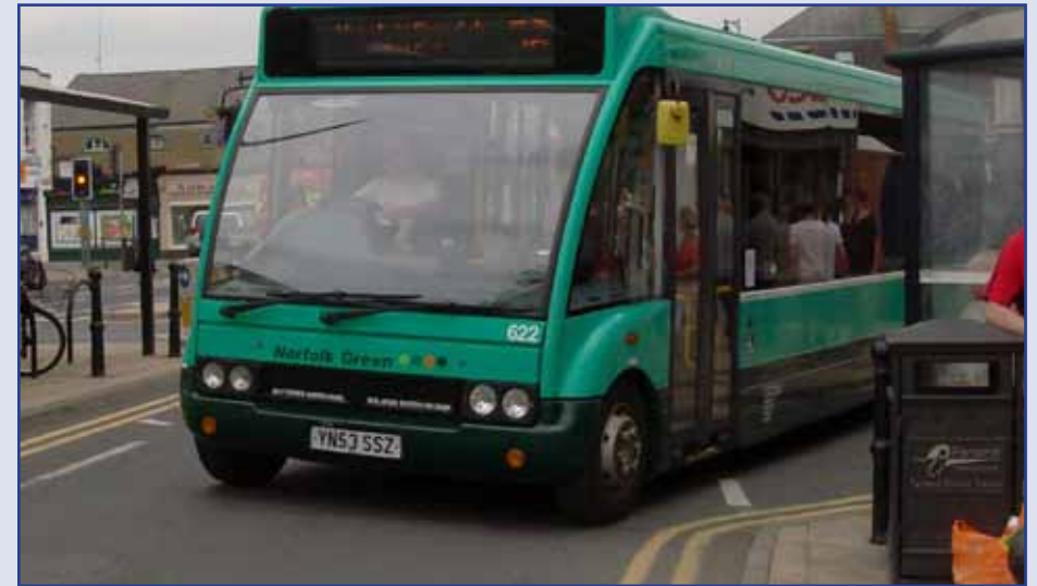
Case study 7 - Travel to work from March to Wisbech by bus